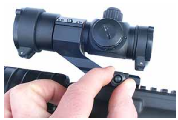
6. Tighten the locking nut finger tight only .