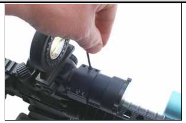
12. Maintaining level, use the Allen wrench to tighten the center screws ½ turn at a time, using an equal number of turns for each screw.