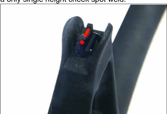
SIGHTLINK is the perfect Back-up front post, giving a "Red Dot" sight picture like the Mark III .