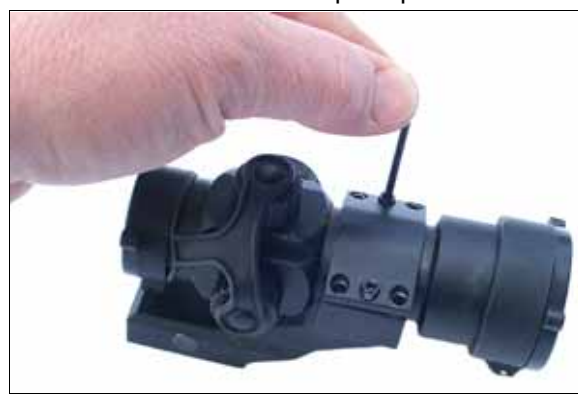
5. Install the Mark III in the mount. Install the center screw only on each side of the top cap -- finger tight only. Do not use Lock-Tite Yet!