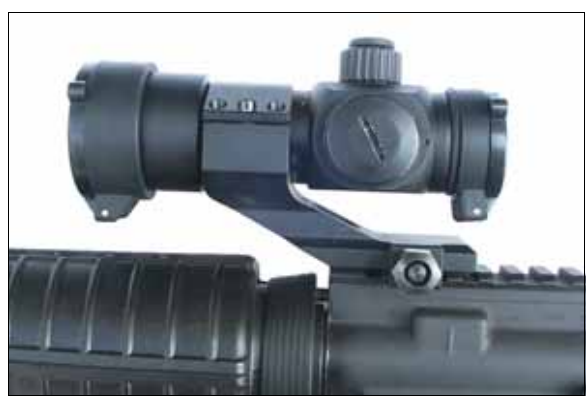
7. Make sure the Mark III base is as far forward on the receiver as possible, while still having all four corners on the receiver rail.