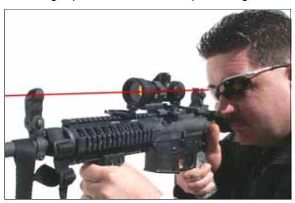
The PCS spacer means you only need to learn a only single height cheek spot weld.