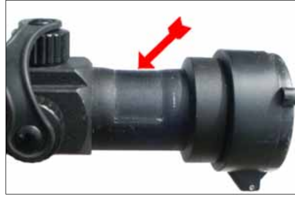
15. Do not over-torque the top cap screws, or the scope tube can be dented.