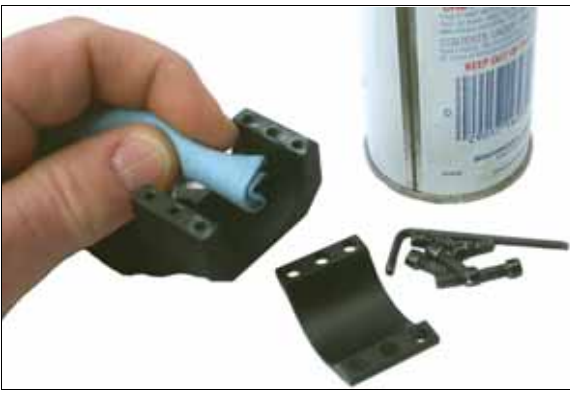
2. De-grease the interior surface of the mount base and the interior of the scope cap.

1. Examine package contents. Included are the Mark III , anti-fog wipes, and cleaning cloth. Mounts, wrench and resin are optional.