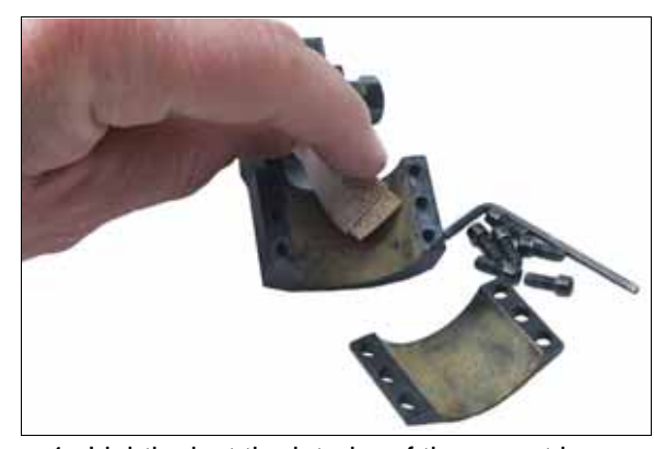
4. Lightly dust the interior of the mount base and the interior of the scope cap with resin.