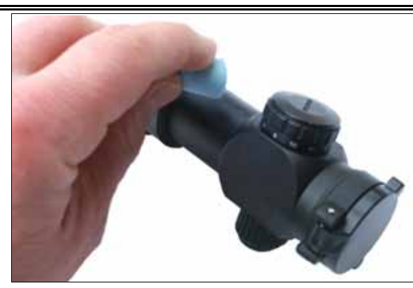
3. De-grease the portion of the Mark III tube that will be clamped in the mount base.