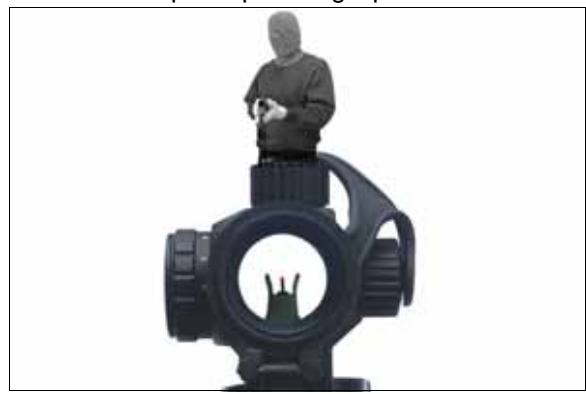
.... May block the view of a low target.