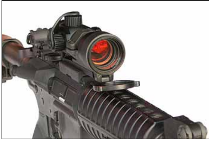
S.P.O.T. Mark III Sport Sight On M4

IMPORTANT: READ THESE MATERIALS BEFORE YOU USE THIS PRODUCT