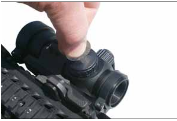
The Mark III uses a flat 3 volt CR2032 battery, which is easily changed with a coin. Carry extra batteries !!!