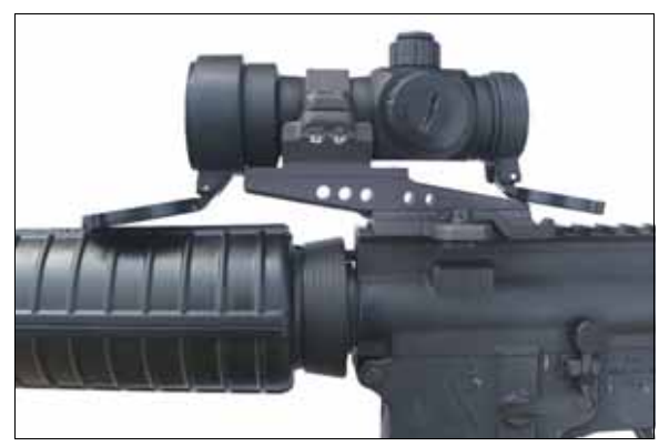
ARMS mounts are also available in a cantilever (forward) mount configuration.