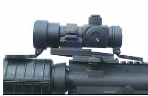
A PCS spacer is available for users who want the "dot" to perfectly co-witness through the same sight plane as the Back-Up Iron Sights.