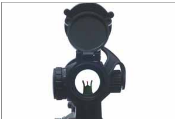
Scope Caps Being Up . . . .