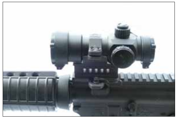
Detachable "Return-To-Zero" mounts by ARMS are also available.