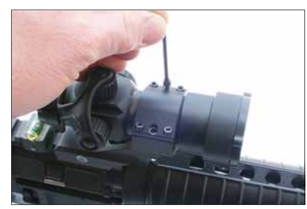
16. When the four corner screws are torqued down, remove the center top cap screws.