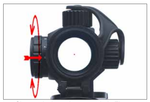
Change dot intensity as needed. Eleven brightness adjustment positions provide flexibility for any lighting level.

The Mark III is a no-parallax sighting system, and so eye relief and perfect alignment of the scope and eye are not major issues. If you can see the dot through the scope, you will hit the target – even if the dot is not centered in the scope tube.