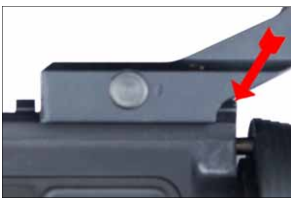
8. Do not mount the base with any corner being unsupported by part of the receiver rail.