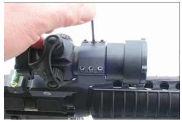
18. Tighten the center top cap screws ½ turn at a time each, alternating, to 18 inch pounds.