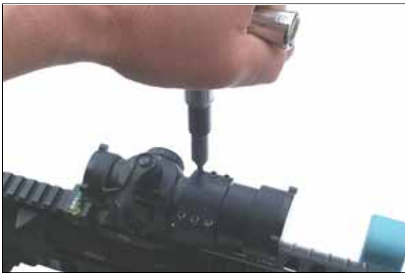
19. Re-check all top cap screws to ensure they are torqued to 18 inch pounds.