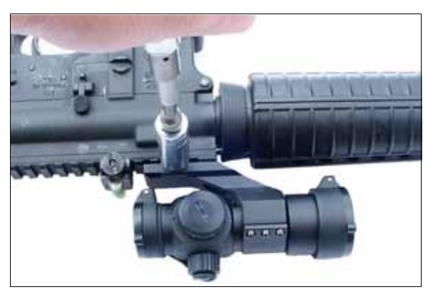
Torque the locking nut to 60 inch pounds.