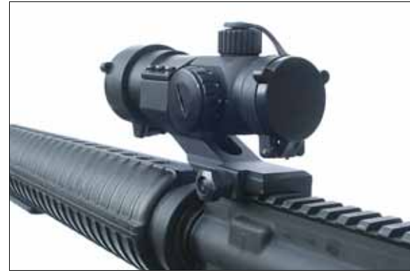
Keep the scope caps closed until needed to prevent accumulation of dust or moisture on the lenses.