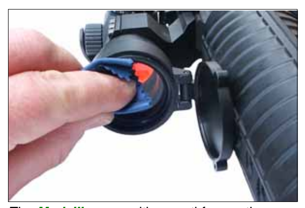
The Mark III comes with an anti-fog coating preapplied, but regular re-coating is recommended. Applicators are supplied. Also use the cleaning cloth supplied to keep the lenses free of dust. Take care not to scratch the lens or the red antiglare coating.