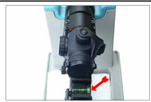
9. Level the receiver rail.